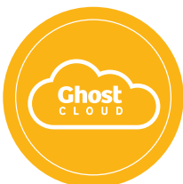
Ghost Cloud booking and despatch

Wallboard will seamlessly integrate with your Ghost booking and dispatch system, Phantom phone system, Passenger App, Driver Companion and Web Booking engine to give you aggregated, up-to-the-minute performance information from these various sources.